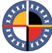
Arctic Athabaskan Council