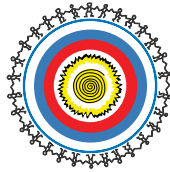
Russian Association of Indigenous Peoples of the North