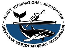
Aleut International Association